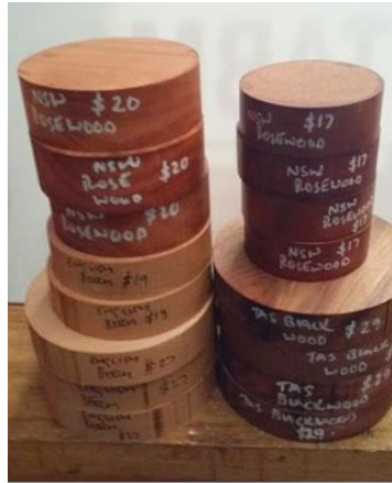
NSW Rosewood - Tasmanian Blackwood English Beech