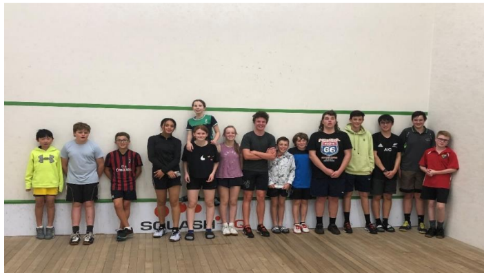
Photo right: Division 1 Players at the end of our Summer Competition

Easter and the school holidays have given our juniors a well-earned break in April, and it is great to see many junior players returning to squash from their summer sports. We have 57 juniors playing across 4 divisions for our Autumn Competition which starts on Monday 3 May.